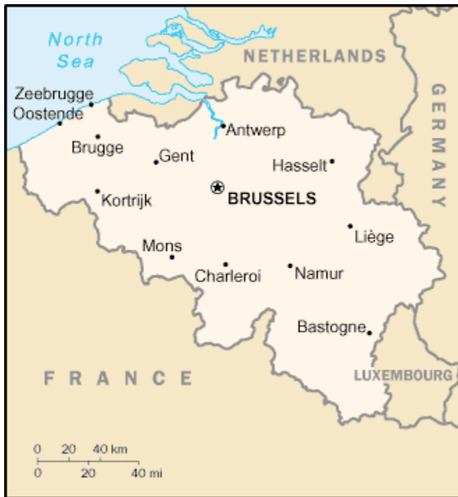
Map of Belgium